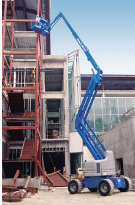
Representative Picture of Genie Articulated Boom

Genie Industries has determined that machines (Models and Serial Numbers Z-80: Z80-101 to Z8009-2448) were produced with the wrong floor loading information in the operator's manual and on the decals. This information indicates that the maximum wheel load is less than the actual maximum wheel load. These models are of the articulated boom type.